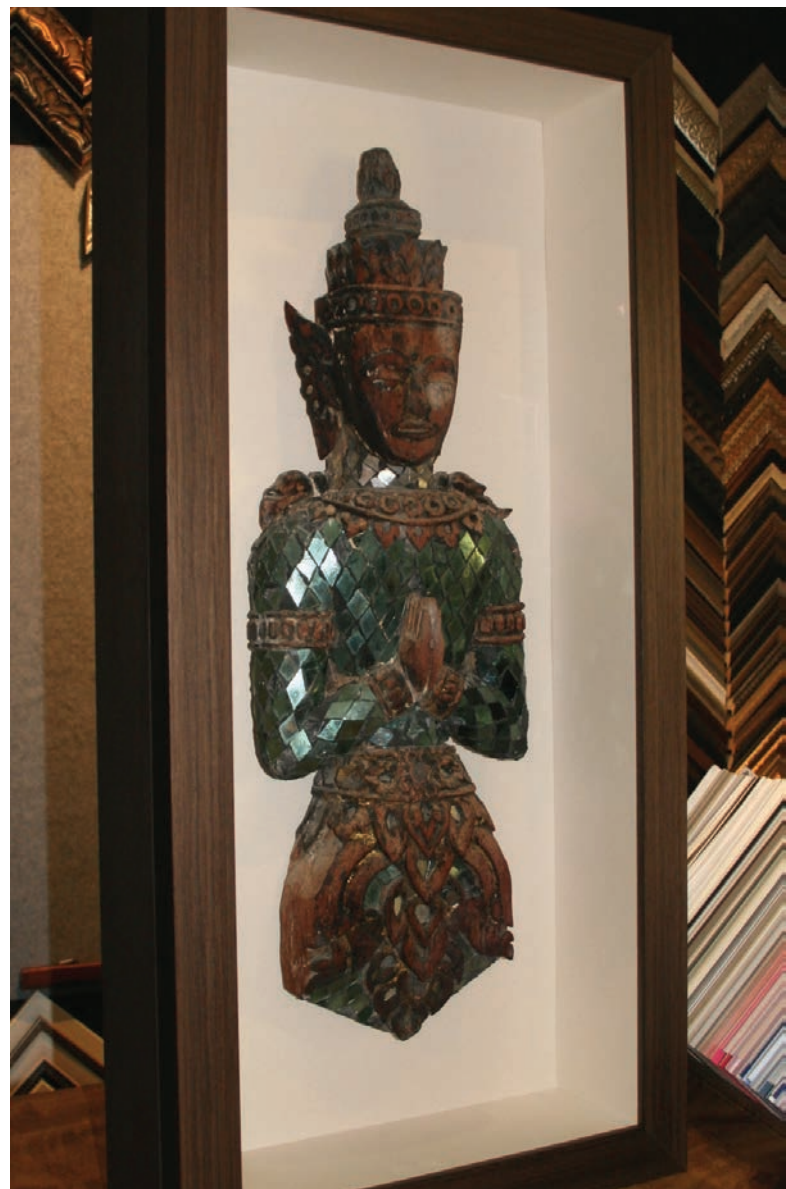
Box framing technique for 3D artworks

Sculptures and other 3D works need to be set back in box framing. There are ways to mount such pieces without using screws or glue that cause permanent damage. Always ask your framer about mounting techniques to ensure that your piece is not damaged in the process.