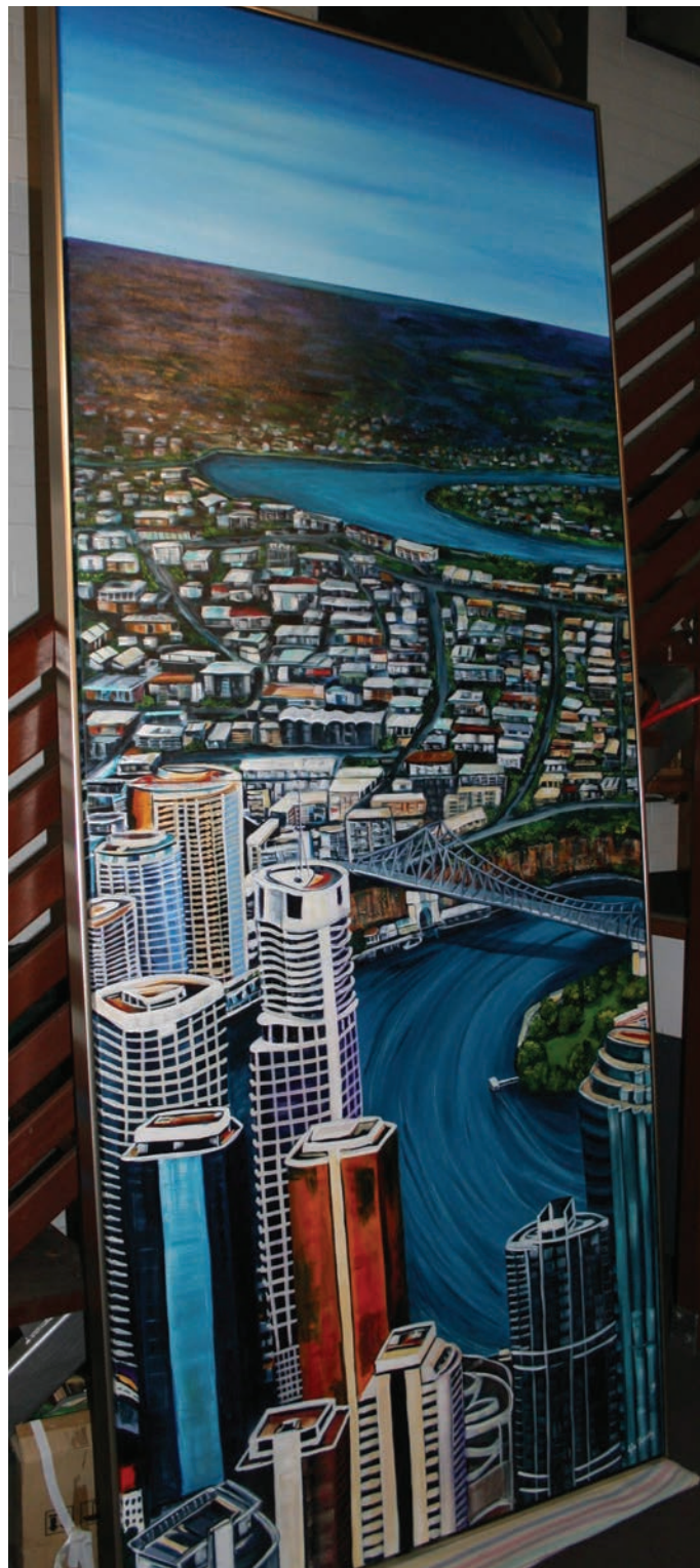
Timber moulding on canvas

Plastic mouldings should be avoided. They have no strength and are not environmentally sustainable. Over time plastic becomes lifeless and brittle.