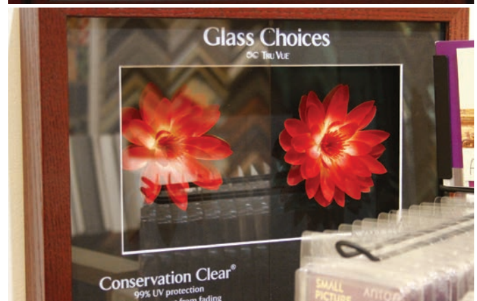
TruVue conservation glass range