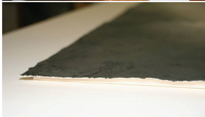
Japanese hinging mounting technique